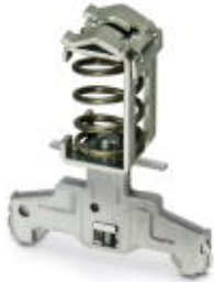
Shield connection terminal block, for applying the shield to busbars

Please be informed that the data shown in this PDF Document is generated from our Online Catalog. Please find the complete data in the user's documentation. Our General Terms of Use for Downloads are valid ( http://download.phoenixcontact.com )